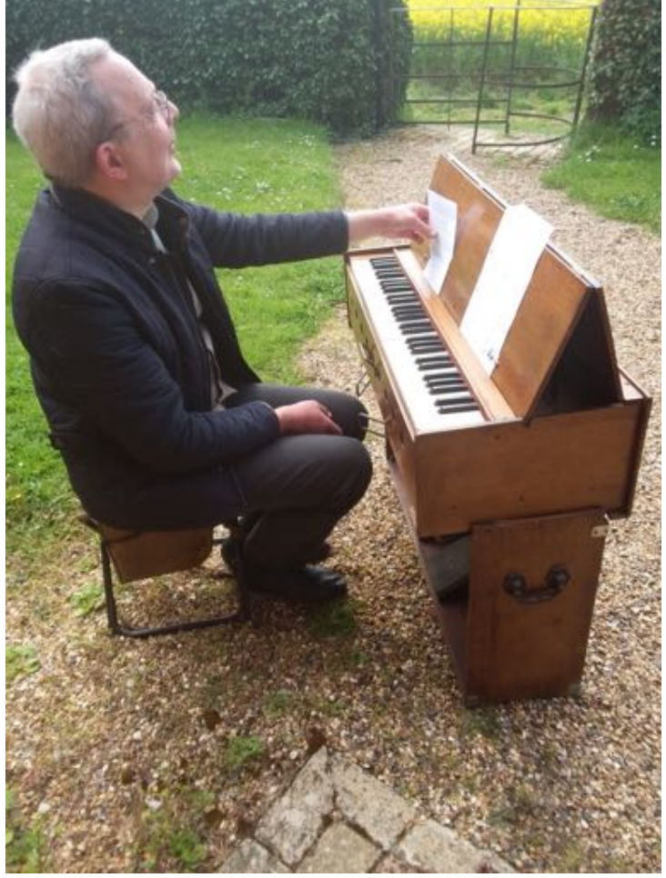
FUN. FIT. FAB.

Exercise classes are in full swing on a Monday evening (7.00-7.45pm), Thursday morning (9.45-10.30am) and Saturday morning (9.00-9.30am) - all taking place on the village sports field. Contact Nic Smith to book your place 07908 445239