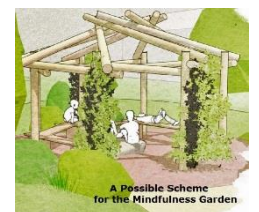
A Possible Scheme for the Mindfulness Garden

Phase 4, the creation of a Mindfulness Garden doubling as an open air classroom or relaxation space, is currently being assessed/evaluated for implementing as a practical, community-led project.